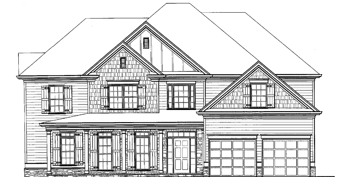
St. Moritz II 🏡 Elevation B