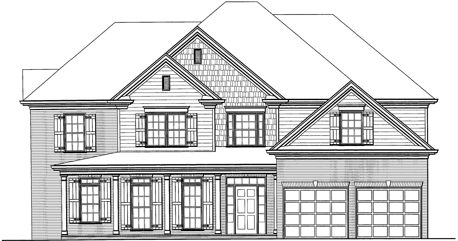
St. Moritz II 🏡 Elevation C