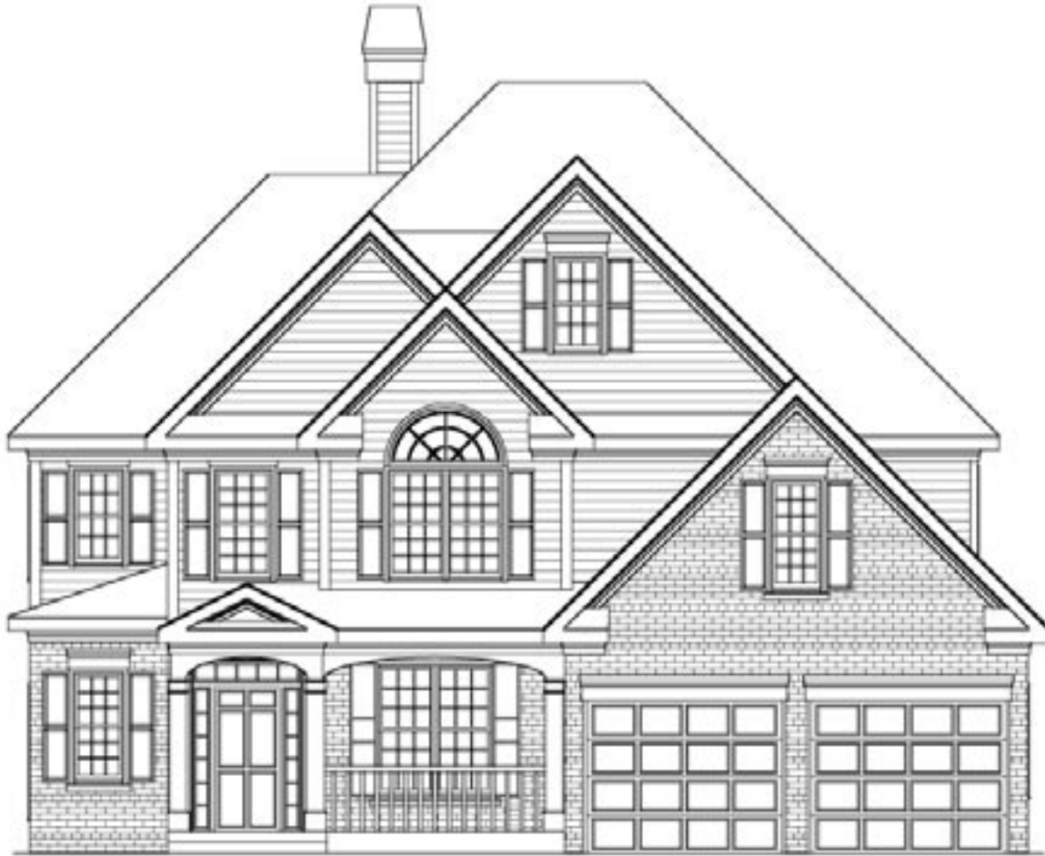
Belmont II ✿ Elevation A